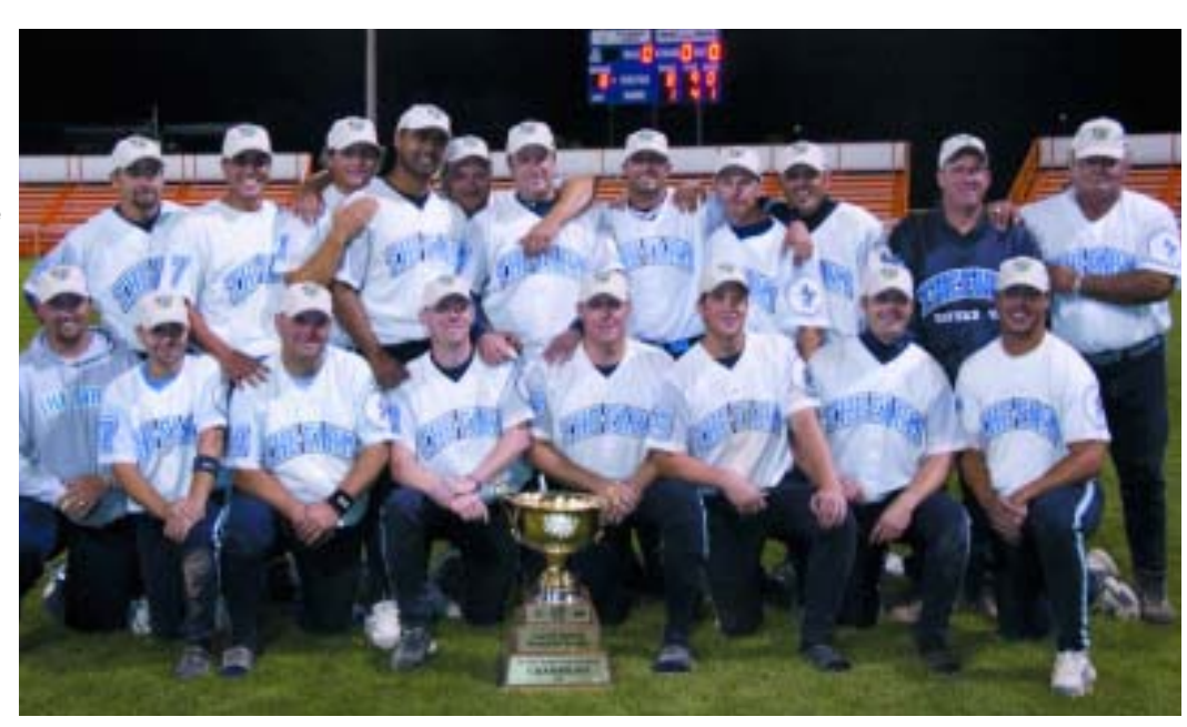
Above: The Farm Tavern of Madison, Wisconsin, 2007 ISC World Champions Lower left: The Farm Tavern celebrates as they clinch the ISC World Title

California. The Bombers were themselves turning heads in the tournament, knocking off the tournament's # 1 seeded Broken Bow, New York to get to the winner's bracket final against the Farm Tavern. (The ISC World tournament has returned to its