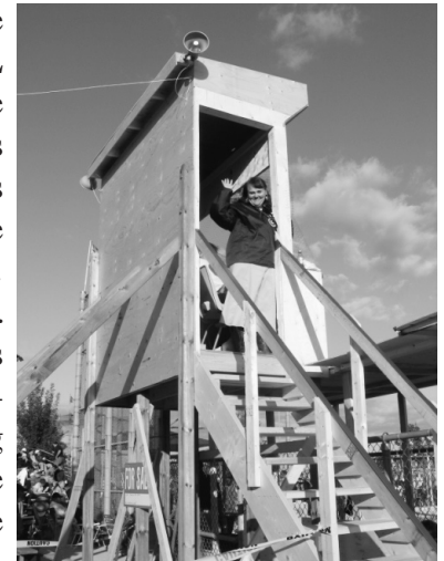
Tammy waves from score-box

If your local league needs a scoreboard, if your kids need a tree house, if your cottage needs a storage shed, inquire about the SUPER DUPER DEAL availability of the 1st base score box. The box, plus roofing from the dugouts will be offered for sale at the end of the week... possibly by auction. Minimum opening bid is half the price of the materials only and winning bidder must disassemble the units – details at the media/finance trailer.