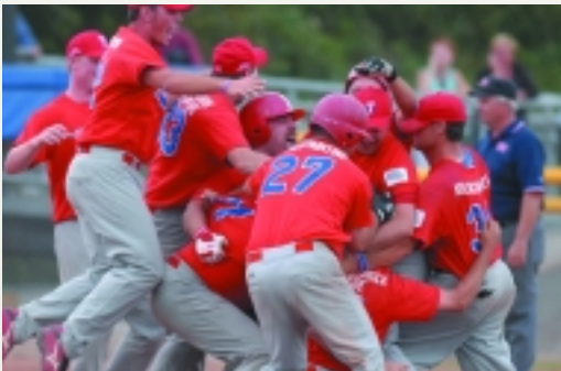
Tavistock, ON Merchants celebrate winning the 2006 ISC II Tournament of Champions.

Tavistock is one of only a handful of teams to contest all five ISC II championships since the inception of the tournament in 2002. With an