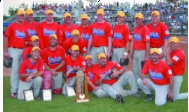
Tavistock, ON Merchants