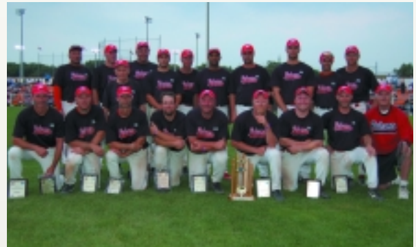
Micksburg, ON Twins