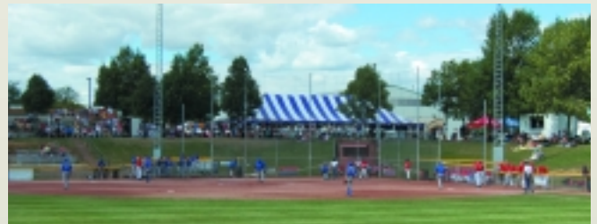
Budd Park in Kitchener, Ontario.

roots for ISC II, as Kitchener was home to the inaugural event back in 2002. There were a total of 35 teams on hand, playing a total of 93 games.