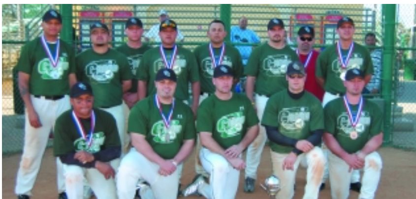
NY Gremlins/Broken Bow, USA