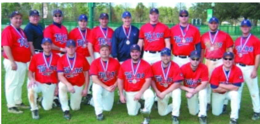
Kitchener Hallman Twins, ON, Canada