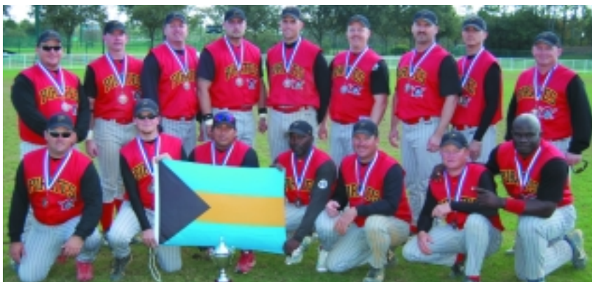
Texaco Pirates, Bahamas